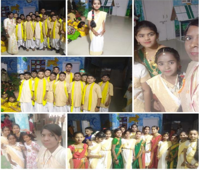
Students perform dance of Tribal people (Maua Zare).