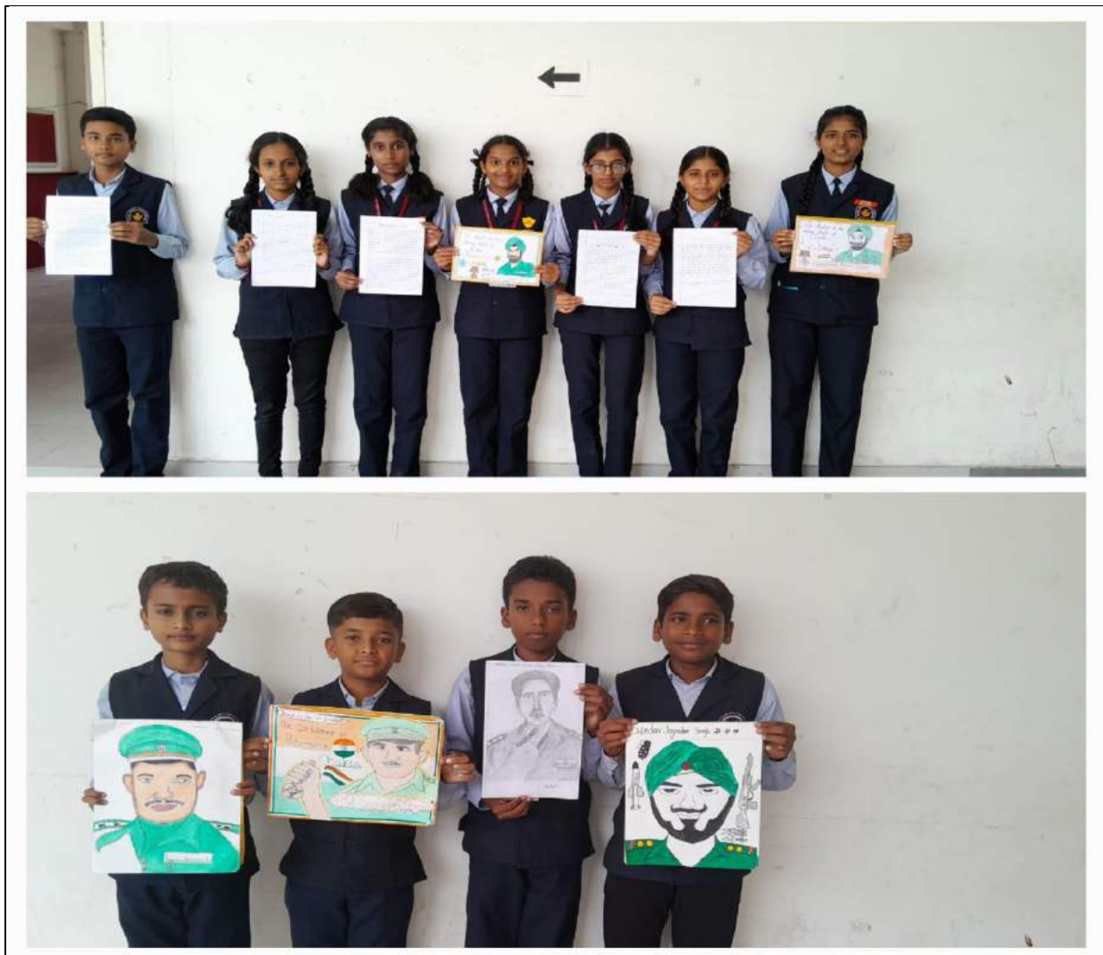
Students with their entries after participating in Veer Gatha Project.

Conclusions: The Veer Gatha Project also aims to inspire the youth of our country to serve the nation and follow in the footsteps of these brave