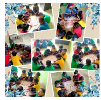
HUMB PRINTING ACTIVITY