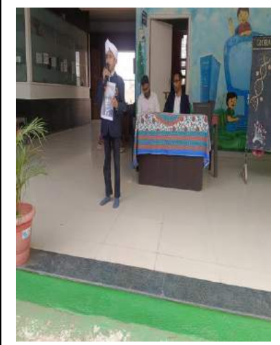
inter school speech class wise competition