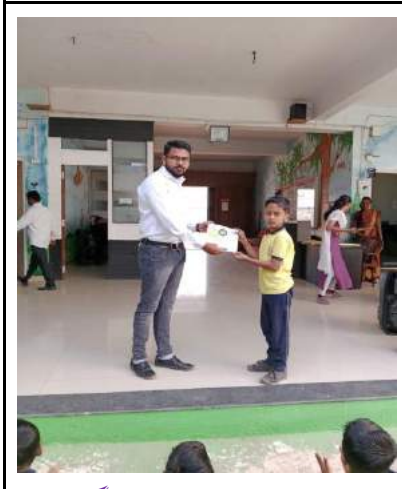
OLYMPIAD PRIZE DISTRIBUTION