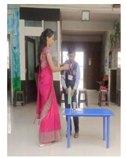
Demonstration of science magic tric