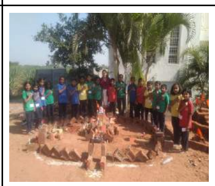
fort making activity