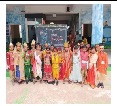
INTER SCHOOL DANCE COMPETITION