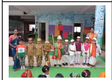
FANCY DRESS COMPETITION