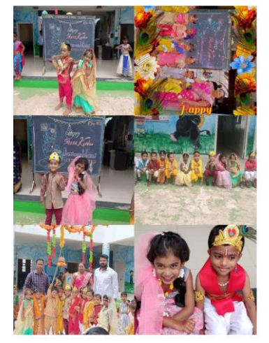
SHREE KRUSHNA JANMASHTMI